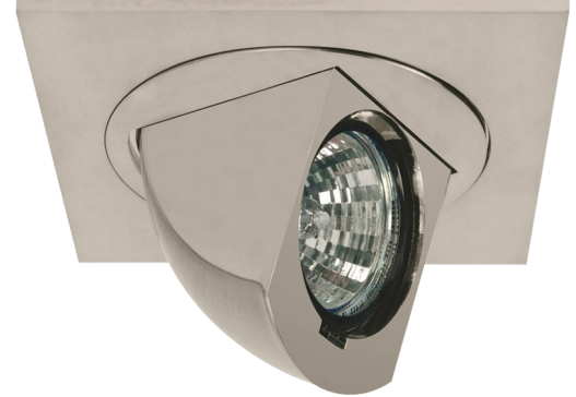
T7124-13 (illustrated) (Lamp not included)