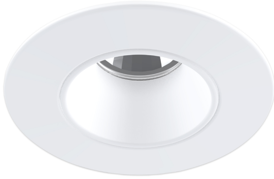
T3450-11-QC (illustrated) (Lamp not included)