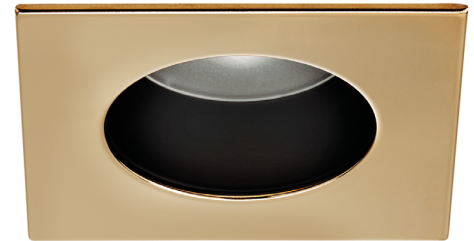
S2100R-03 (illustrated) (Lamp not included)