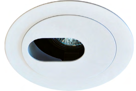
T7800-01 (illustrated) (Lamp not included)